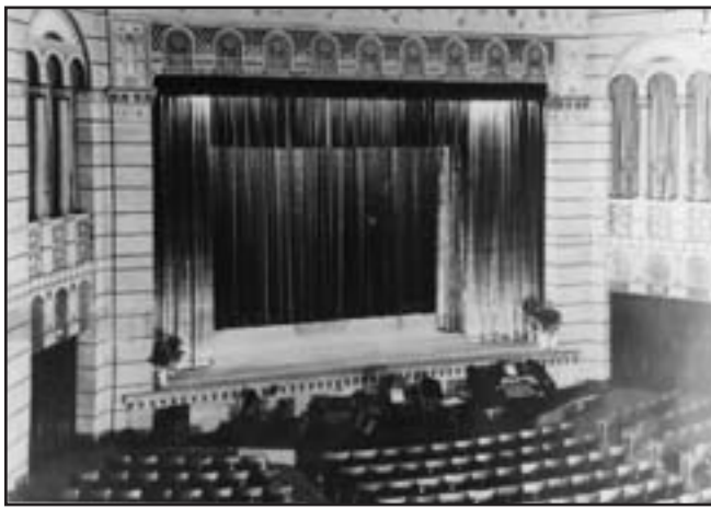
Then: Called “a triumph of artistry and craftsmanship,” the expansive stage, grande-colonnade and Middle-Eastern styling marveled newcomers in 1927.